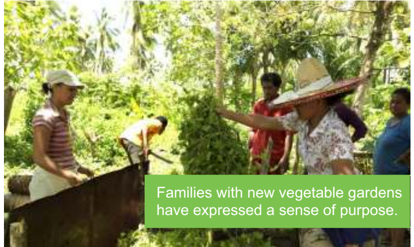
Families with new vegetable gardens have expressed a sense of purpose.

Most families' food gardens around their homes were completely destroyed by the tsunami, with a small number of families also losing their coastal plantations. While many families had inland plantations that were unaffected, they did not have vegetable gardens.