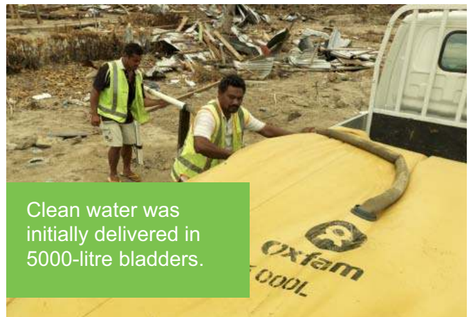
Clean water was initially delivered in 5000-litre bladders.

These initial activities ensured access to safe water for 4500 people. Communities reported that the food and essential items they received were sufficient to meet their needs.