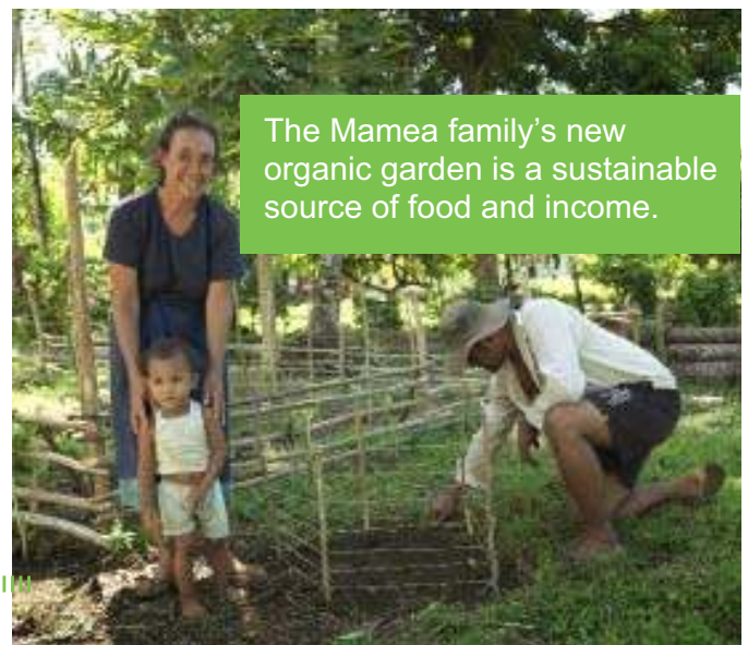
The Mamea family's new organic garden is a sustainable source of food and income.

The planting work supported by WIBDI has helped reinforce lifestyle changes that have resulted from moving inland away from other livelihood options such as fishing. The planting materials are readily utilised by families who now have more time to work in the garden because they don't have to travel from the coast to get to their land. Some feel that in the past it was hard to go to the plantation to plant taro and other crops; but now things are easier as they can plant crops right beside their own house.