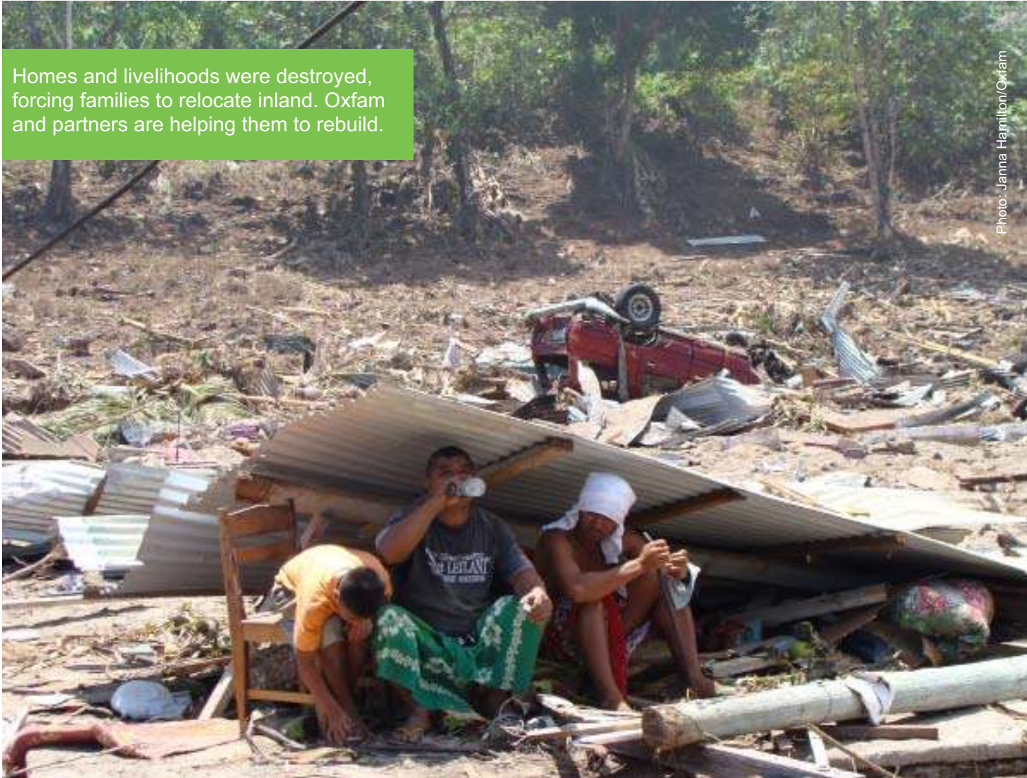
Homes and livelihoods were destroyed, forcing families to relocate inland. Oxfam and partners are helping them to rebuild.