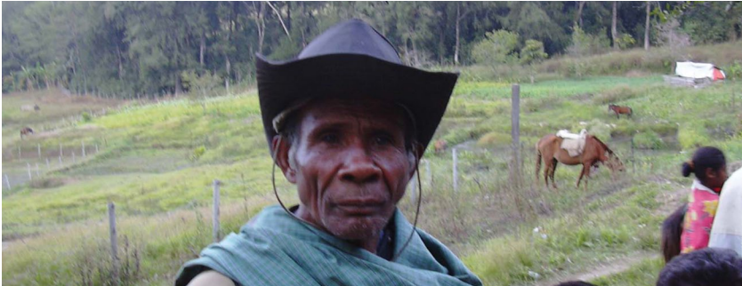
Farmer delivering coffee on horseback, CCT, East Timor

East Timor's coffee production is small in the global coffee context, producing less than one percent of the international total. Nevertheless, coffee is crucial to the country's overall economy. It is currently the most important source of foreign exchange for East Timor and it serves as the primary source of income for about one-fourth of the country's population, or some 44,000 families.