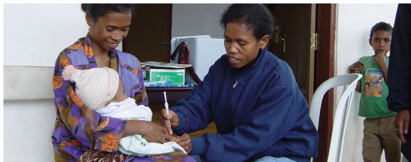
Clinic Cafe Timor, CCT, East Timor

CCT is a large cooperative that faces many challenges, one of the most difficult challenges being its size. As CCT's Fairtrade sales increase so will its ability to provide more farmers with the benefits of Fairtrade. CCT is working towards all of its members enjoying the benefits of Fairtrade.