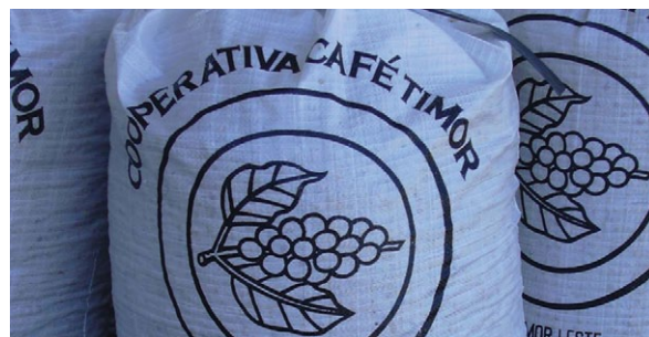
CCT branded coffee sack, CCT, East Timor

Export commodities: coffee, sandalwood, marble.