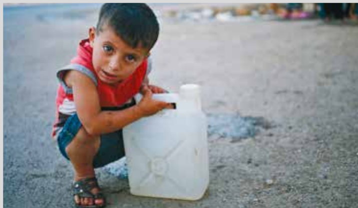
A boy pauses as he carries water back to his new home in a school on the outskirts of town.