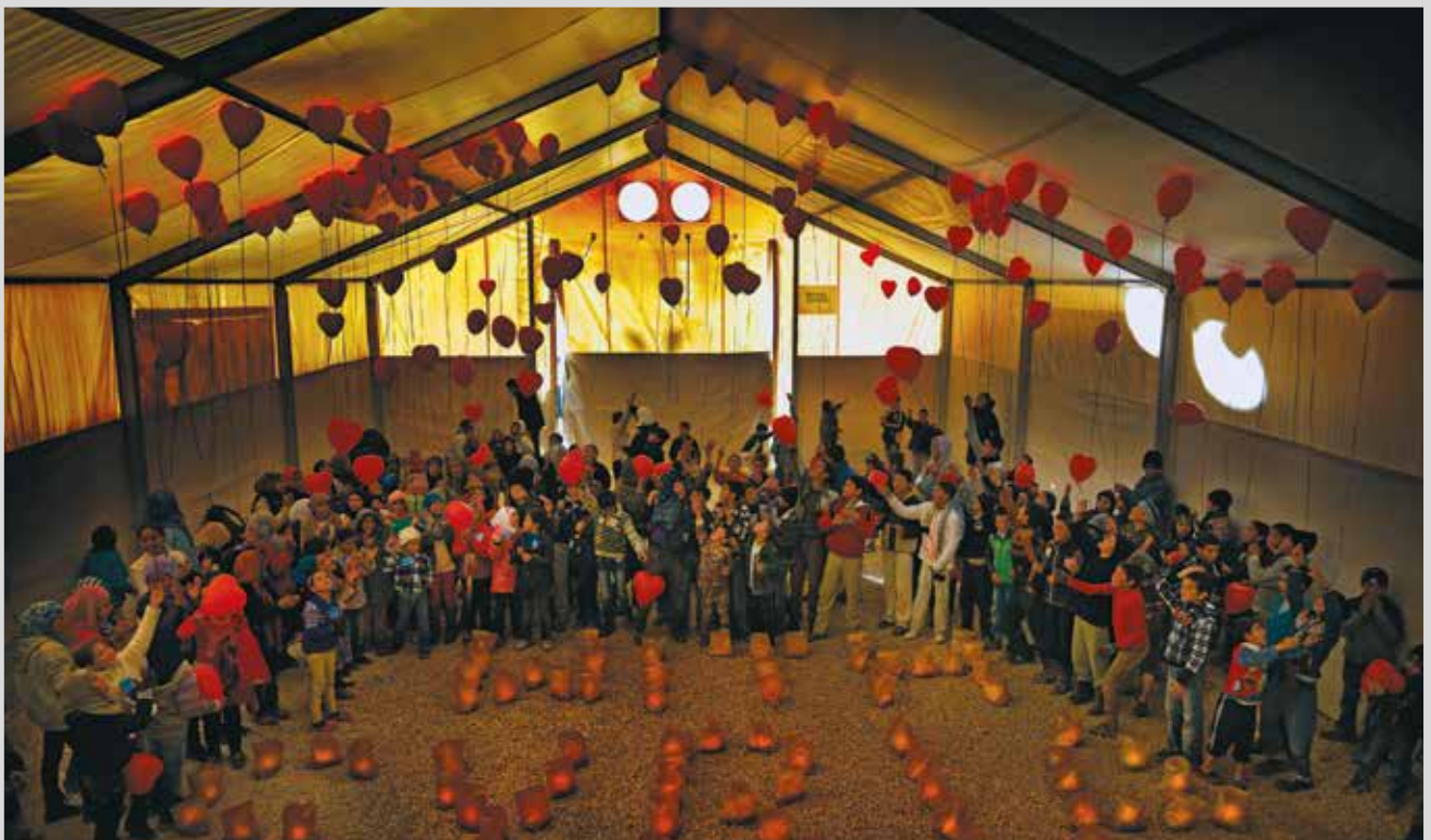
Children release balloons in Za'atari refugee camp to mark three years since the start of the Syria crisis. Syrian voices joined a coalition of 117 humanitarian and human rights groups including Oxfam to simultaneously launch a pledge for world leaders to commit to making this the last anniversary marked by bloodshed.