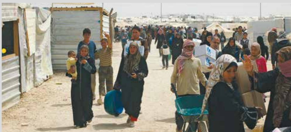
In refugee camp situations we always take account of the differing needs and expectations of women and men. In Za’atari camp, we have been working to give women a greater say in the plans for the future.

In Jordan, a survey we carried out in Za’atari camp revealed that people are highly dependent on aid. But women, who usually have to care for the family, are rarely heard when they raise concerns about how aid is organised, planned and delivered. They also said they had time and energy to invest in making things better. As a result, we are empowering women to take on leading roles, and ensuring that their views are included in the design of the UNHCR’s future governance plan for the camp.