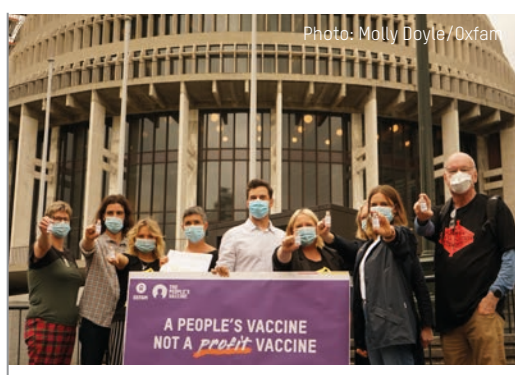
Oxfam spoke out in coalition with activists and organisations around the world, pushing for a 'People's Vaccine' for Covid-19 – one that is based on shared knowledge and is freely available to everyone everywhere.